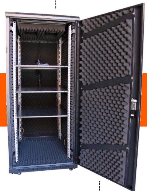
EGG TRAY Acoustic Foam