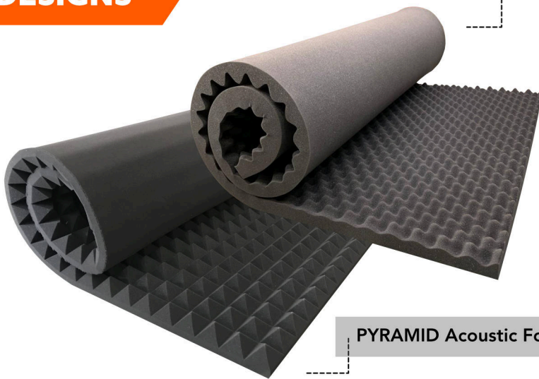
PYRAMID Acoustic Foam